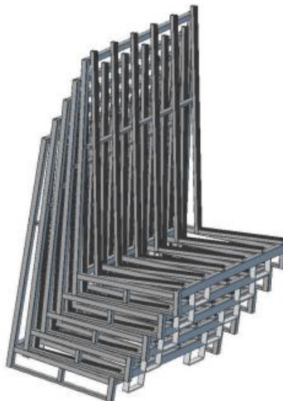
Fig. 2 Stack of empty racks type 30.01B.03.. to 30.01B.09.. and 30.03... for transport - maximum of 5 pieces.